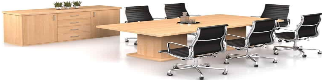
Meeting table, 10 X Classic Eames Repo Range Genuine leather midback chair Black