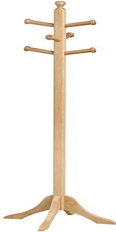
2x Hat Stand 485x485x1680 -Mahogany